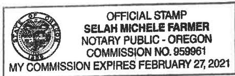
Notary Public-State of Oregon